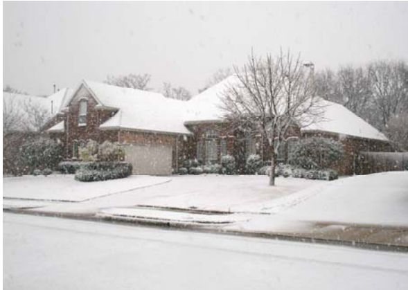
Snow in Bakers Branch